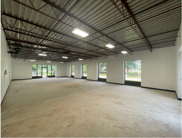
Interior Office Area