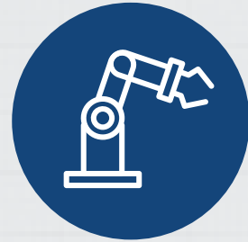
AV & Robotics

Close to major metros, international markets, and natural resources, the Pittsburgh region has become a hotbed of innovation for new industries like Artificial Intelligence and Robotics, as well as legacy sectors that are quickly evolving, such as Energy and Manufacturing.