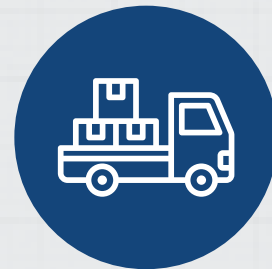
Logistics & Transportation